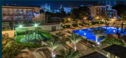
DMCI HOMES - LA VERTI